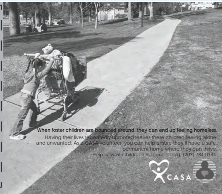
When foster children are bounced around, they can end up feeling homeless. Having their lives repeatedly uprooted leaves these children feeling alone and unwanted. As a CASA volunteer, you can help ensure they'll have a safe, permanent home where they can thrive. Help now at ChildrenInPlacement.org , (203) 784-0344.

Children In Placement 300 Whalley Avenue New Haven, CT 06511 www.childreninplacement.org 203-784-0344